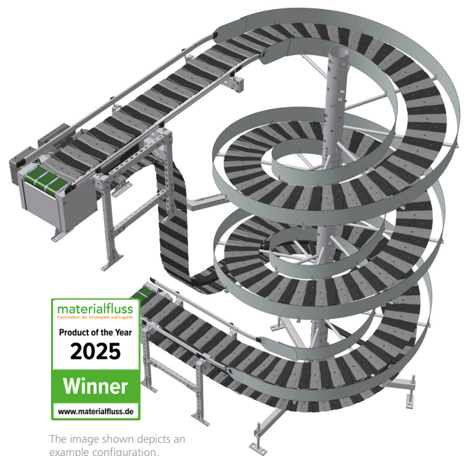
The image shown depicts an example configuration.

The ferag.spiral is part of the ferag modules portfolio, known for low planning effort and quick deployment. Customers can receive a non-binding offer in just a few clicks and efficiently optimize their intralogistics processes